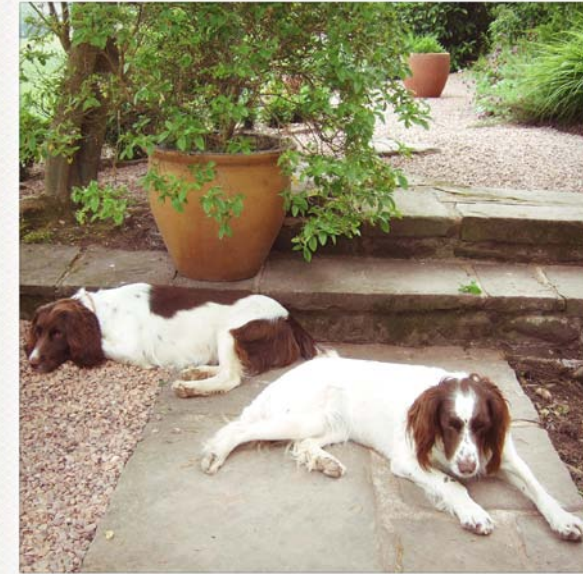
Dilly and Sorrell

Despite their health problems, their owner says that she would not change her dogs 'for the world' and explains why she is so grateful to helpucover: